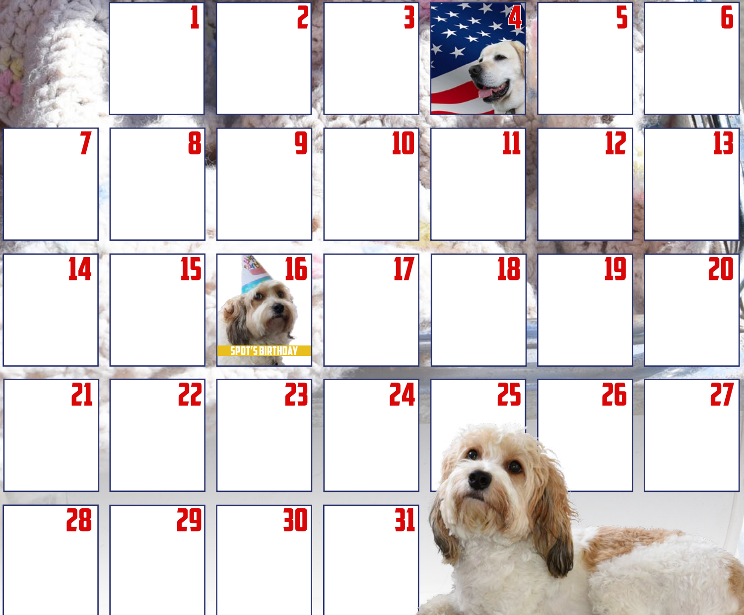
Calendar photos from The Lost Dog

Sunday ★ Monday ★ Tuesday ★ Wednesday ★ Thursday ★ Friday ★ Saturday