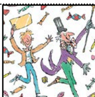
Charlie and the Chocolate Factory by Roald Dahl