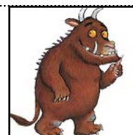
The Gruffalo by Julia Donaldson